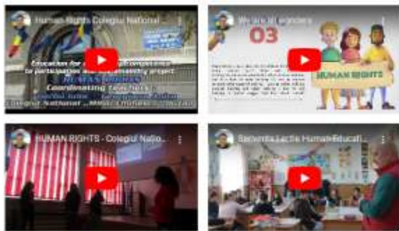
Videos of the pilot course compiled on the project website.

On May 22 nd , 2023 , a webinar took place in which all the members of the ECCOPS project and the secondary education teachers of the three countries participated.