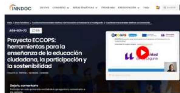
Video of the paper presented at the INNDOC 2023 Congress

participation and sustainability" ( https://inndoc.org/ponencia/proyecto-eccops-herramientas-para-la-ensenanza-de-la-educacion-ciudadana-la-participacion-y-la-sostenibilidad/ ).