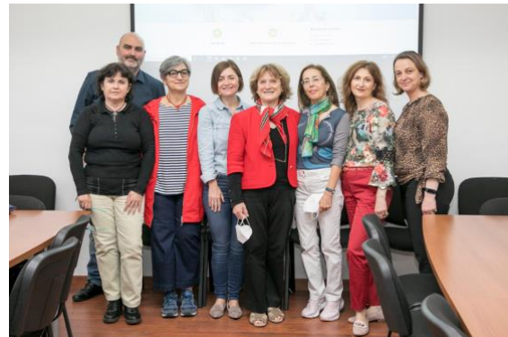
The project consortium in La Laguna (ES)

In the first face-to-face meeting of the project, the members discussed the different educational strategies and the design of tools aimed at training students as citizens, and encouraging them to be an active part in their school and in their community, all linked to the horizontal priority of the project "Common values, civic commitment and participation". Relevant budget issues were also reviewed.