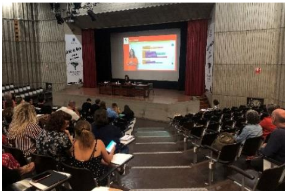
Multiplier event at High School La Laboral (La Laguna, Spain)

In September 2022 another Multiplier event of the Project ECCOPS in presence took place, this time in La Laguna (Spain) at High School La Laboral.