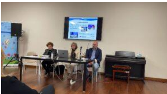
The Italian research team in Palermo (IT)

In April 2022 the first Multiplier event of the Project ECCOPS took place in Palermo (Italy), in presence at Liceo Scientifico Galileo Galilei, and online on the ECCOPS website ( eccops.uciim.it/presentazione/ ) and on UCIIM YouTube channel ( youtu.be/PWsrQBKI2IE ).